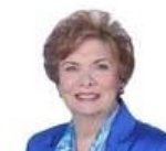
Elaine Bloom Plaza Health Network