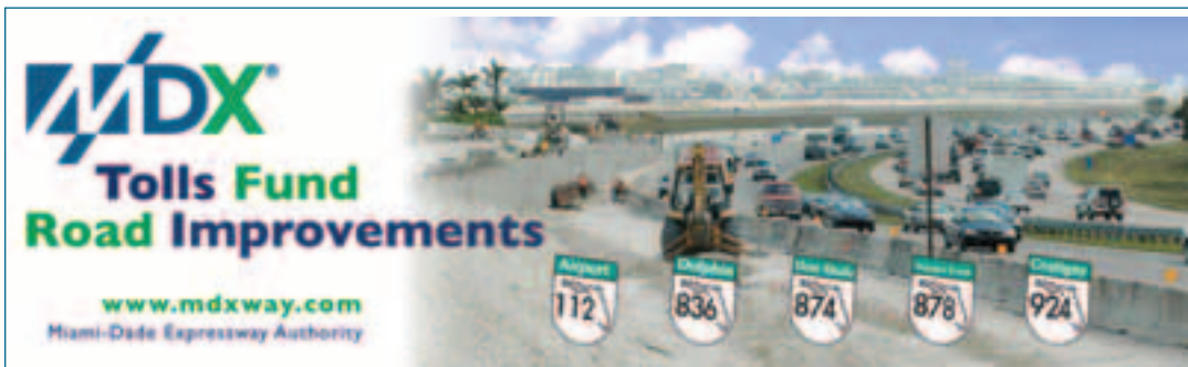
Billboards near MDX expressways in May and June remind motorists of the role their tolls play in improving and expanding roads in the system.

The ORT master plan outlines a capital improvement program designed to convert toll collection on MDX expressways from a cash-based system with a few toll plazas to an all-electronic/video system covering all MDX roadways. Implementation of the master plan does not mean approval of toll sites and toll rates; each phase of the plan will go through a public outreach process – including public hearings – to determine location, rates and a timetable for implementation.