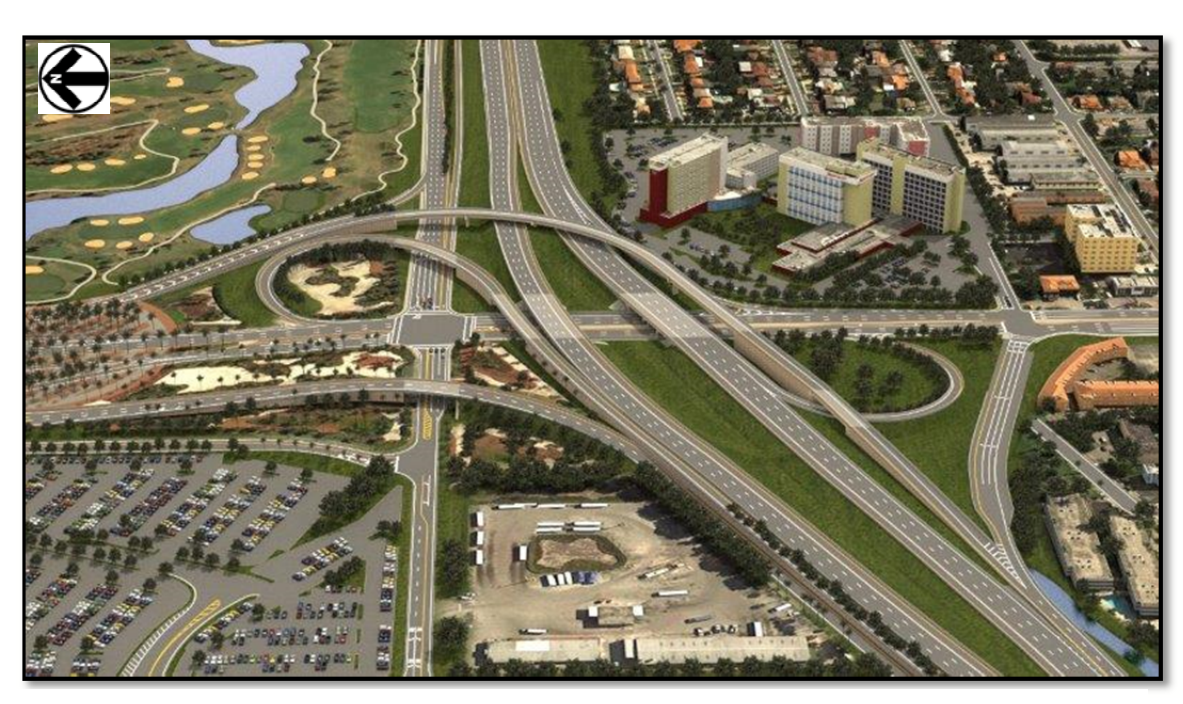
Rendering of SR 836/NW 42<sup>nd</sup> Avenue interchange after construction.

over more traditional interchange formats as left turns across oncoming traffic are eliminated. Drivers will briefly cross over to the left or "opposite" side of the road in a crisscross or diamond pattern.