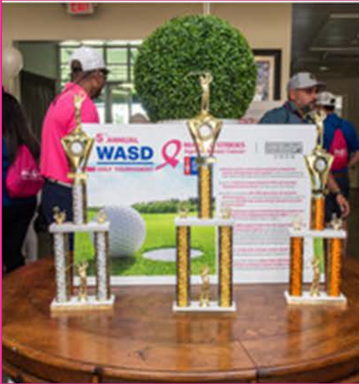
Country Club of Miami