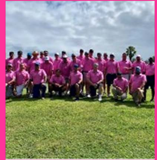
Country Club of Miami