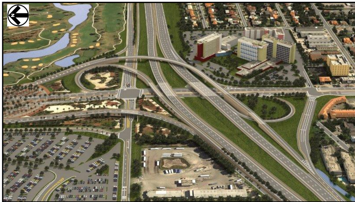
Rendering of SR 836/NW 42 nd Avenue interchange after construction.