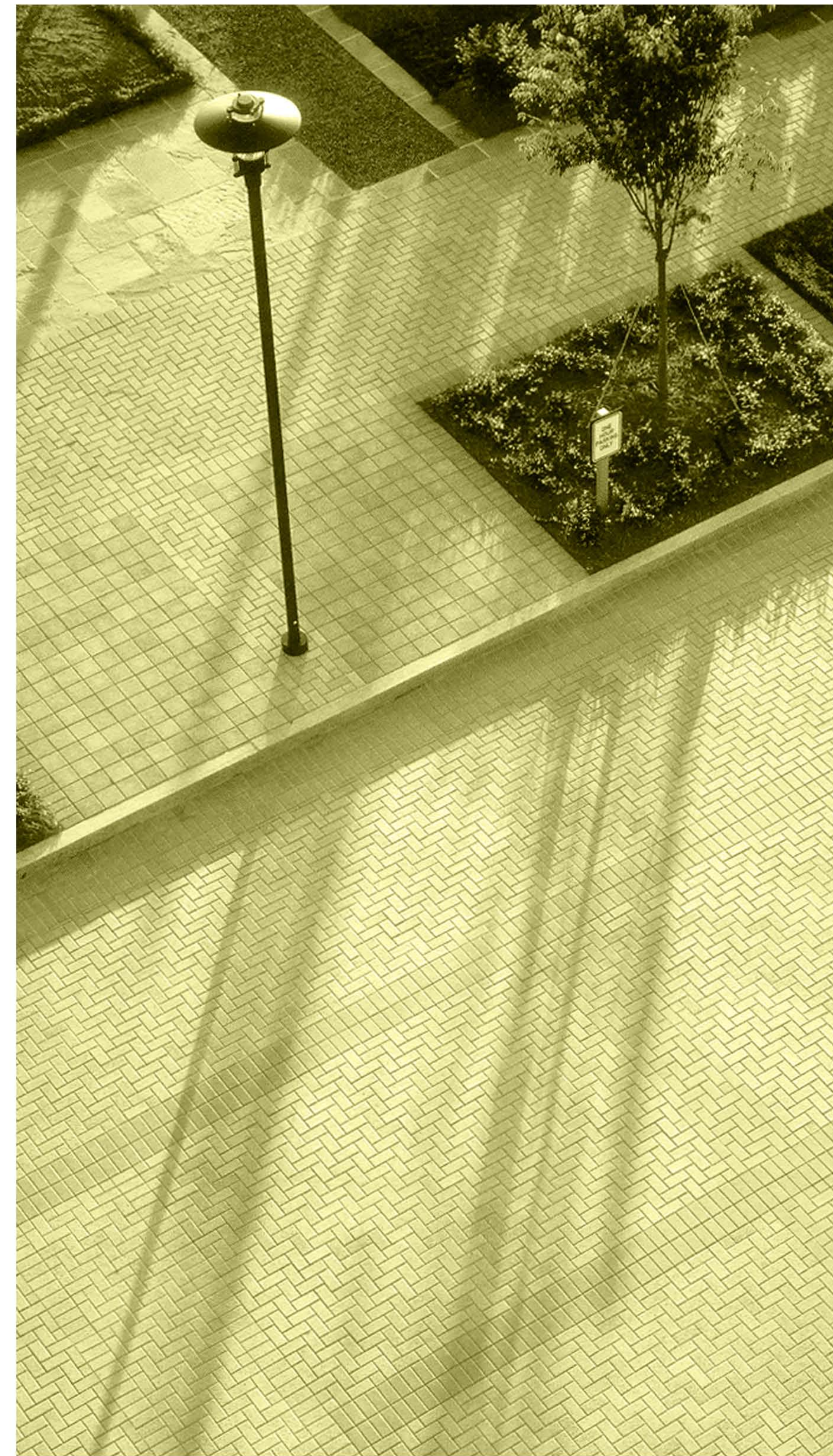
DECORATIVE CONCRETE PAVERS